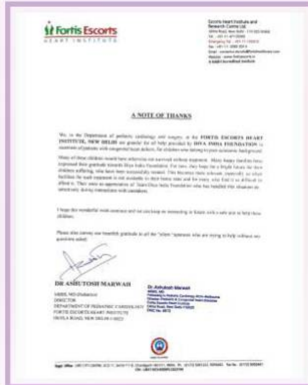
Appreciation from Fortis Escorts, New Delhi.