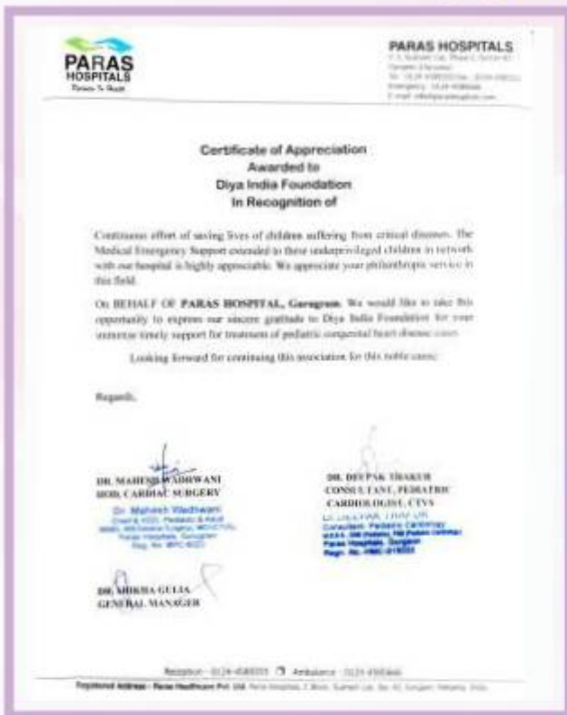
Appreciation from Paras Hospital, Gurugram