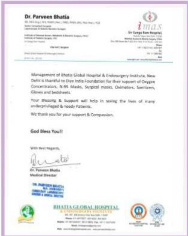
Appreciation from Bhatia Global Hospital, New Delhi.